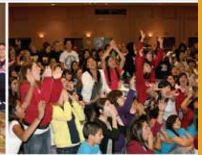
YOUTH LEADERSHIP PROGRAM AT DISNEYLAND® RESORT - JANUARY 29, 2016