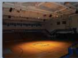
CUSTOM GYMNASIUM LIGHTING PACKAGES

A COMPLETE SOLUTION FOR PROFESSIONAL EQUIPMENT SALES, INSTALLATION & RENTALS