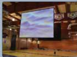
BACK TO BACK 12'X16' SCREENS AND PROJECTORS