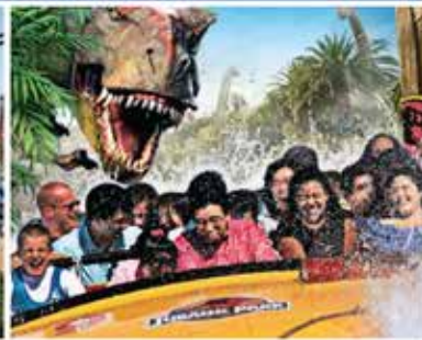
DISNEYLAND® RESORT • MAGIC MOUNTAIN • UNIVERSAL STUDIOS HOLLYWOOD