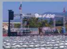
GRADUATION SOUND & TRUSS STRUCTURE SYSTEM RENTAL