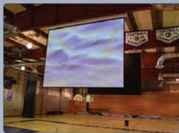
BACK TO BACK 12'X16' SCREENS AND PROJECTORS