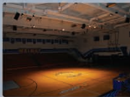
CUSTOM GYMNASIUM LIGHTING PACKAGES