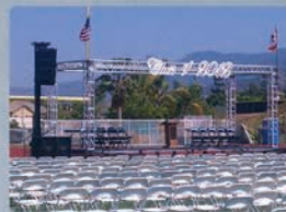
GRADUATION SOUND & TRUSS STRUCTURE SYSTEM RENTAL